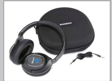
Includes detachable cable and carry case

Samson unites its experience in professional acoustic design with the latest ambient noise filtration technology to introduce the new RTE X Active Noise Cancelling Headphones. Featuring a lightweight, over-ear design with ultra-soft cushioning, the RTE X headphones are ideal for enjoying powerful, studio-quality audio with superior sonic clarity in loud environments and extended travel settings.